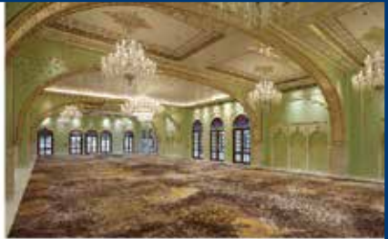
THE IMPERIAL ROOM

Hyatt Regency Jaipur Mansarovar Iskcon Rd, Mansarovar, Jaipur, Rajasthan, India, 302020 T: +91 141 222 1234 jaipurmansarovar.regency@hyatt.com