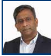
Prof. Dr Mohamed Rela

Chairman - Centre for Liver & Biliary Sciences Max Hospital, Saket, New Delhi