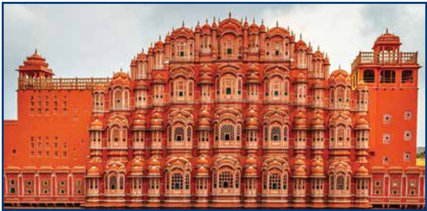
Hawa Mahal Jaipur

Jaipur traces back its origins to 1727 when it was established by Jai Singh II, the King of Amber. He shifted his capital from Amber to the new city because of the rapidly-growing population and increasing water scarcity. Noted architect Vidyadhar Bhattacharya used the established principles of Vastu Shastra to build the city.